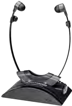
ACC371 Audioport A200 ACC371B Replacement Battery

The A200 is a stereo personal sound amplifier for people who may sometimes need to rely on assistance for their hearing. Due to the stereo amplification via two integrated electret microphones, the user can clearly determine the direction of the sound source within an 8' to 10' radius. Dynamic headphone transducers ensure a natural and transparent sound reproduction with optimum speech intelligibility.