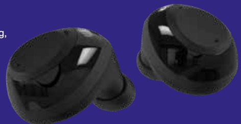
IQBUDSBOOST Intelligent Wireless Hearing Buds