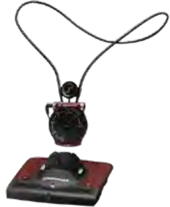
ACC416A Sennheiser® Set 830-S ACC371B Replacement Battery

The Sennheiser® 830-S is an infra-red stereo TV listening systems. It enables listening anywhere in the room without the need for cables and without disturbing others. Directly connectable to a TV, Hi-Fi system or radio, it guarantees outstanding sound quality and optimised speech intelligibility, thanks to switchable compression and treble emphasis.